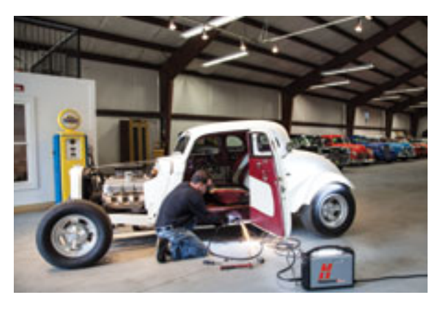
Vehicle repair and modification